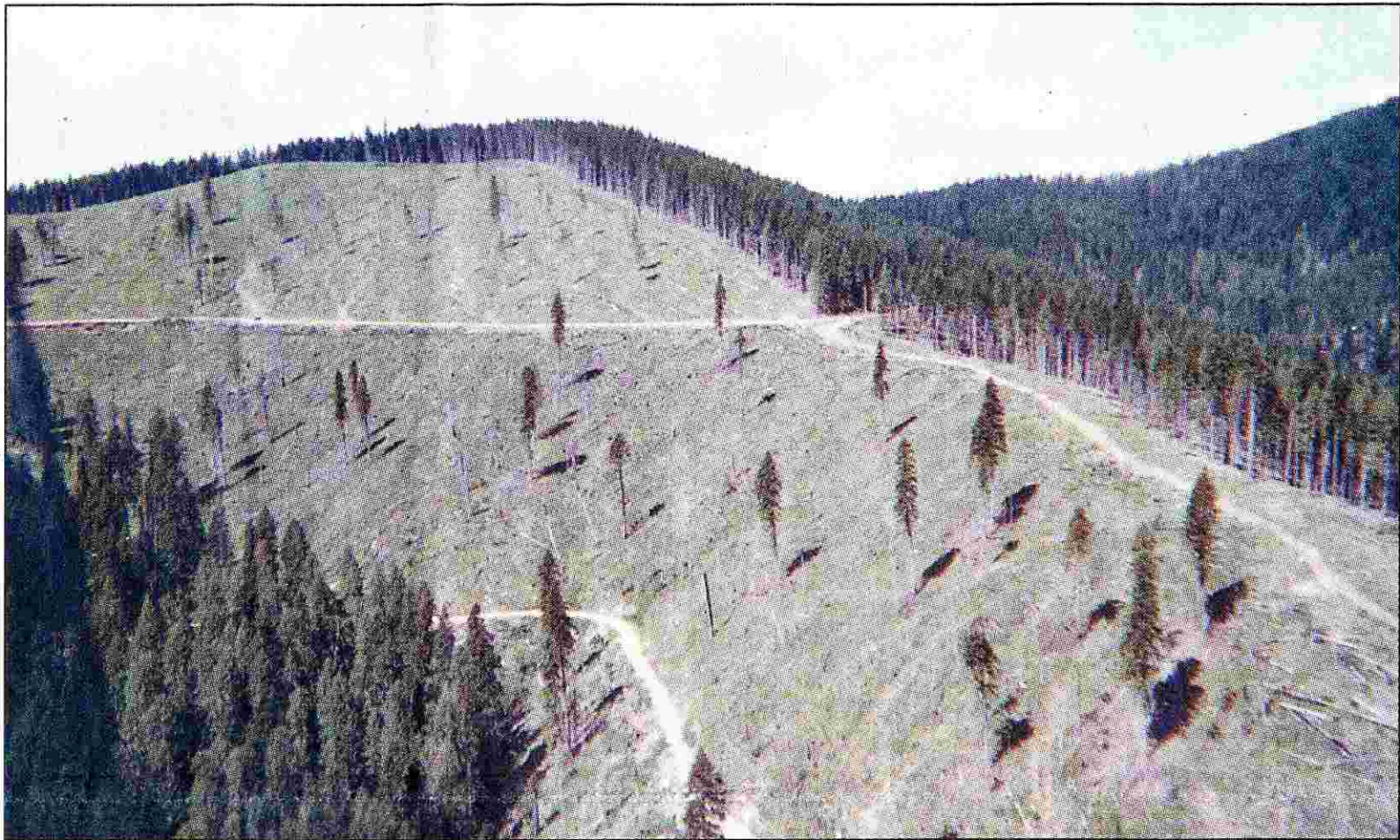
The Mica Creek clear-cut as seen from the air. Large healthy trees are left to act as sources of seeds in the area, Dead snags are left standing for the use of certain bats and other wildlife.